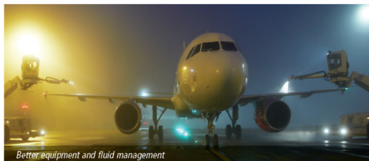
Better equipment and fluid management

Our Bay Management Software is designed to operate all of the AIM System products and other software-based data systems. Additional systems or modules are easily added to the core system and do not require a complete core system overhaul.